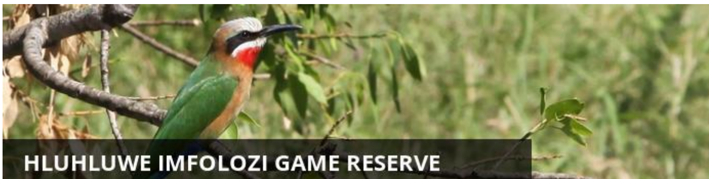
HLUHLUWE IMFOLOZI GAME RESERVE