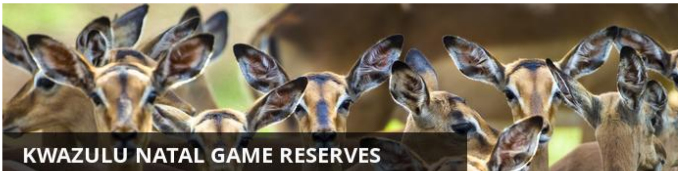
KWAZULU NATAL GAME RESERVES