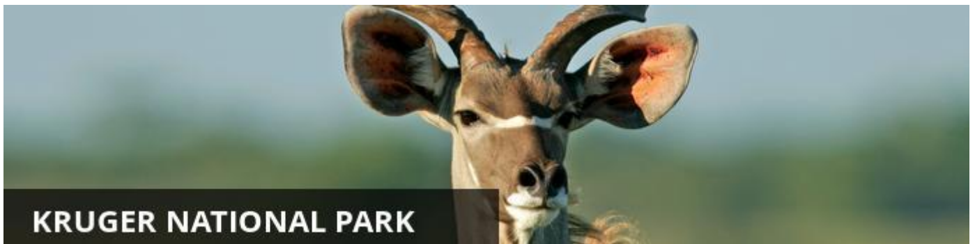
KRUGER NATIONAL PARK