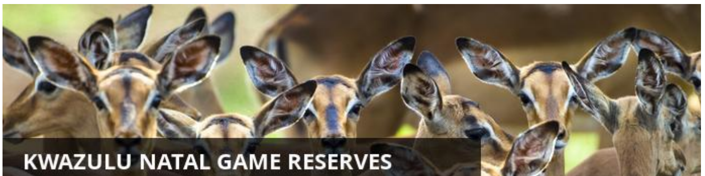
KWAZULU NATAL GAME RESERVES